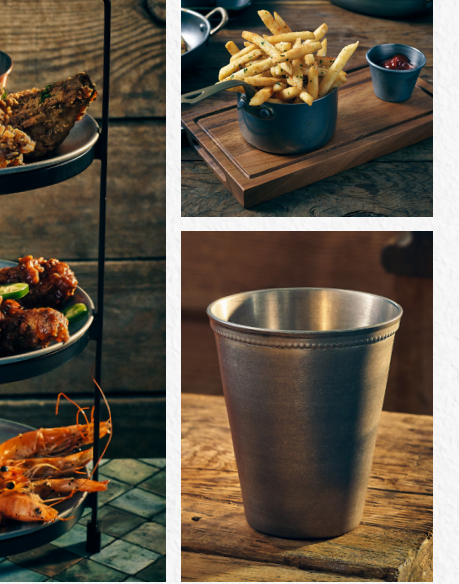
naterial is rust-proof